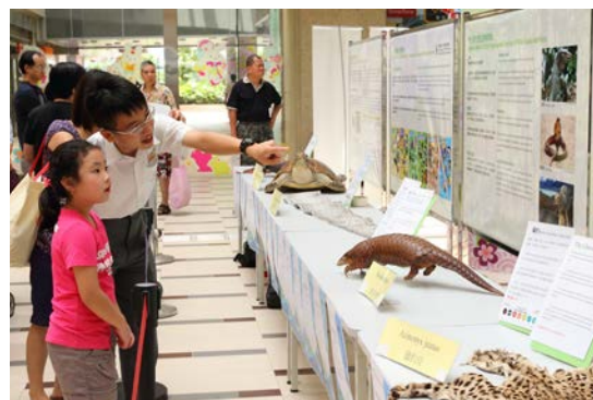
▲ Sing Yin held an Environmental Exhibition on Endangered Species Protection in Choi Tak Estate

In order to encourage environmental protection in the wider community, Sing Yin has organized projects such as the Green Family Fun Day, the Environmental Exhibition on Endangered Species Protection and the Household Energy Saving Campaign. School tours with detailed introduction to our green facilities are regularly arranged for different organisations, ranging from kindergarten and elderly centres, to community groups, professional bodies and overseas delegates.