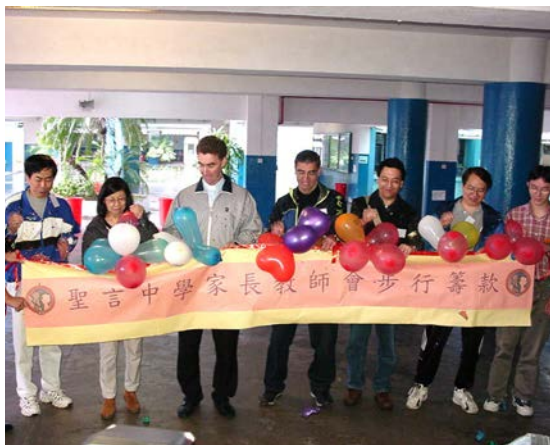
▲ Sing Yin Fundraising Walkathon in 2001

The following events will be organized for fundraising purposes.