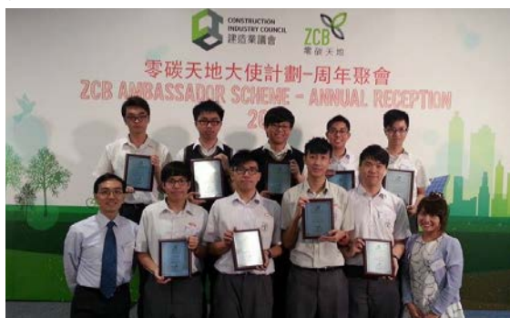
▲ Sing Yin students won numerous prizes in the ZCB Student Ambassador Scheme organized by Zero Carbon Building

Sing Yin adopts a whole school, interdisciplinary approach to realize its aim for environmental education. A wide array of programmes are implemented, such as organic farming, the food waste collection and composting programme, the Teachers and Students Low Carbon Cooking Competition, the Bartering Activity, the Environmental Protection Week, and numerous other competitions and projects. It is particularly remarkable that students take the initiative to organise or volunteer in these activities, with many of them also serving in the 60-strong Environmental Prefect Team in senior forms, or as the Environmental Monitor of each class in junior forms.