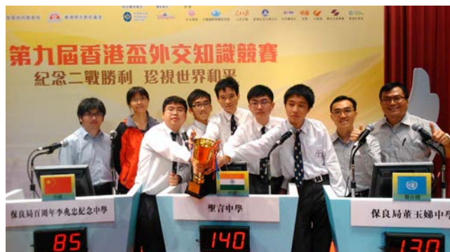
▲ The Sing Yin Quiz Team has excellent performance in major competitions

With their hard work and admirable team spirit, the sports teams of Sing Yin have attained prominent rankings in recent years, and they won prizes in inter-school competitions, for example, the Athletics Championships, Cross Country Competition, Football Competition, Handball Competition, Shuttlecock Invitation Tournament, Swimming Competition, Table Tennis Competition and Basketball Competition.