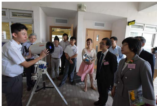
▲ The committee members of the Sing Yin Astronomy Club gave a demonstration on the Open Day