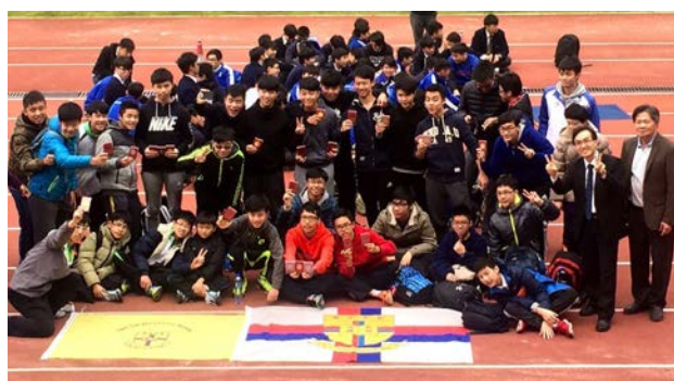
▲ The Sing Yin Athletic Team has outstanding achievements in recent years