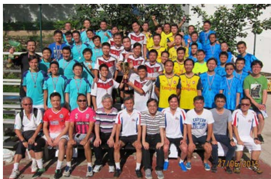
▲ Winning teams in the Alumni Football Cup in 2015

The first Alumni Football Cup was held in 2015, with 30 participating teams formed by over 400 alumni. Building on the previous success, the Sing Yin Alumni Association will once again organise an Alumni Cup Charity Match in late 2016. Now with both the football and the basketball categories, the Alumni Cup 2016 will promise to be a precious opportunity for sporty old friends to reunite and team up for some fun, exciting games as in the good old days, and for a most worthy cause.