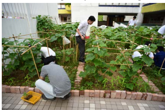
▲ Teachers and students worked together on the organic farm